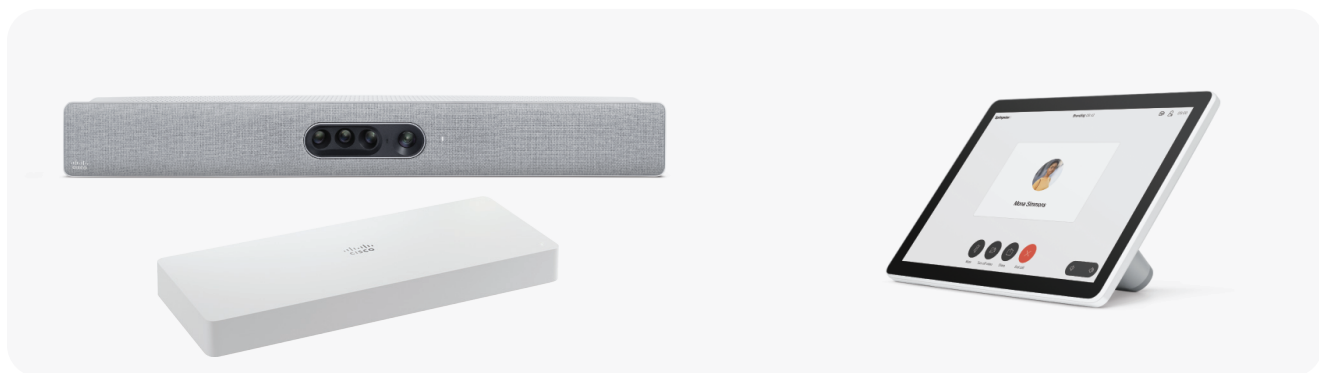
Figure 2. Default components of the Webex Room Kit Plus: Webex Codec Plus, Webex Quad Camera, Webex Room Navigator